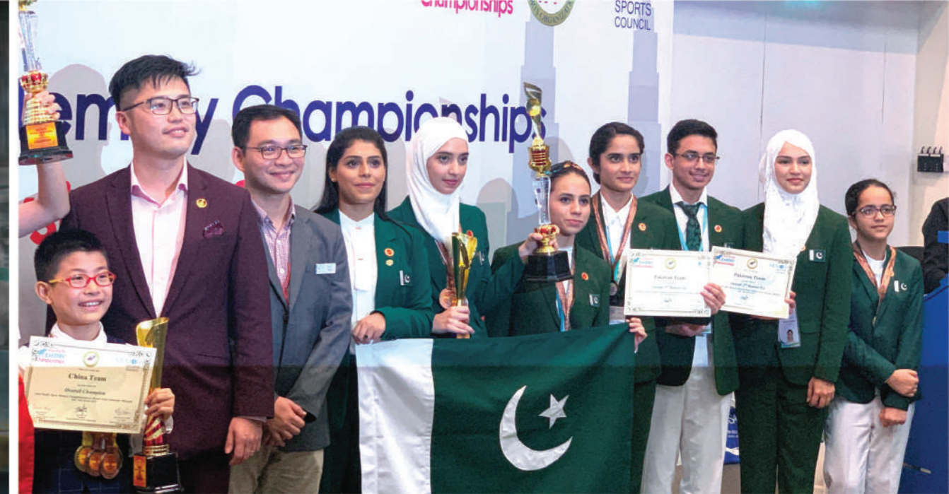
Team Pakistan won 3rd Place Country Award amongst 9 competing countries at the 3rd Asia Pacific Memory Championship 2019, Malaysia.