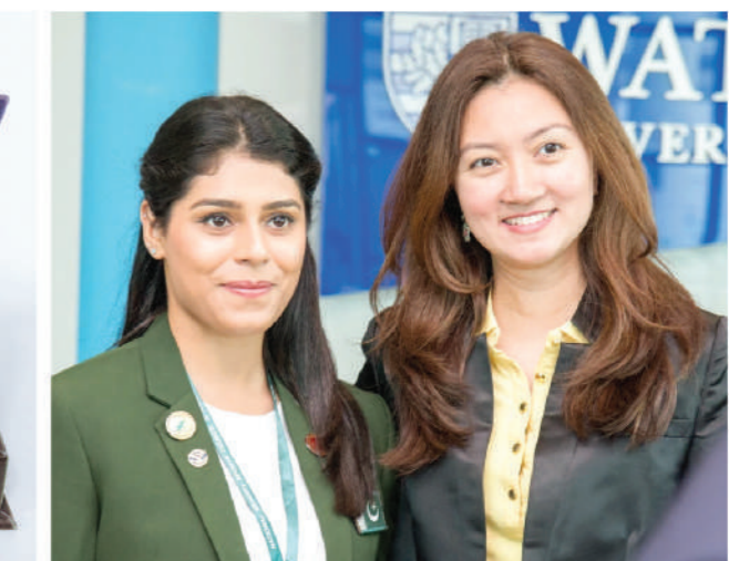
Sania Alam with Princess Tengku Faizwa Razif of Malaysia.