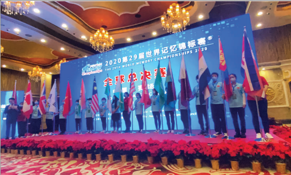
Opening Ceremony of 29th World Memory Championship 2020