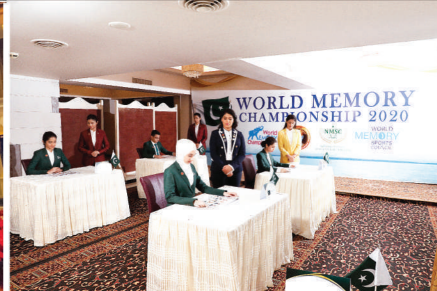
Team Pakistan during the 29th World Memory Championship 2020.