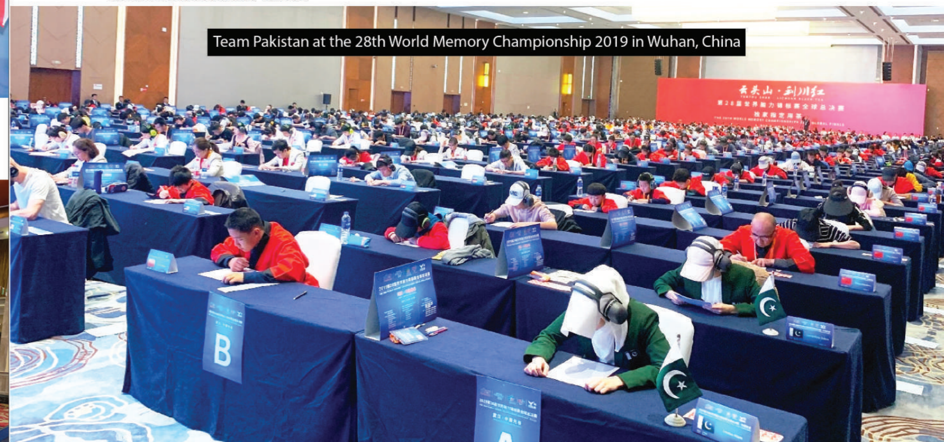
Team Pakistan at the 28th World Memory Championship 2019 in Wuhan, China