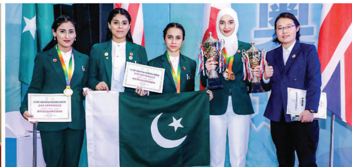
Team Pakistan at the 12th World Speed Reading Championship 2019 and 11th World Mind Mapping Championship 2019, Beijing, China.