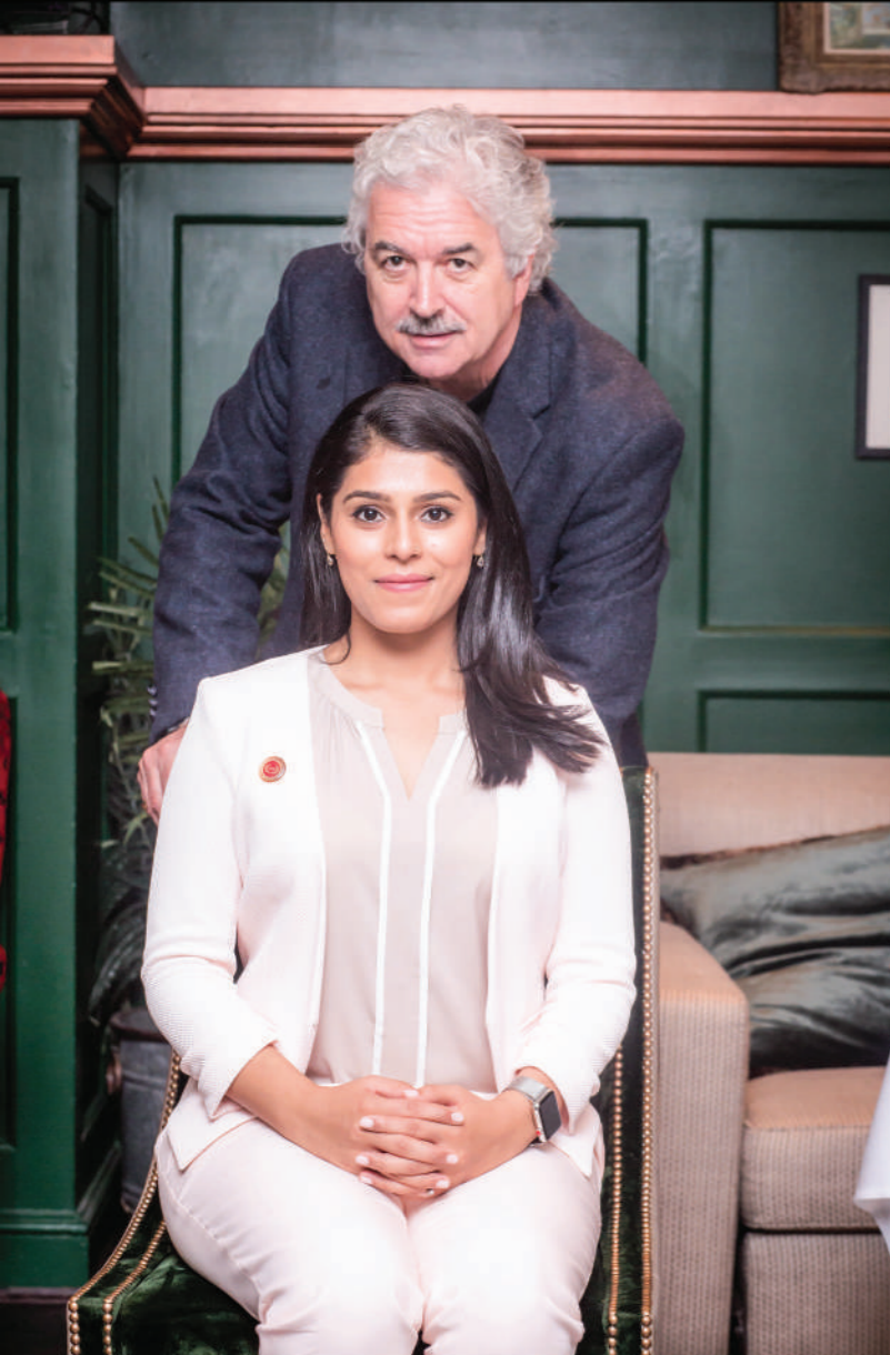
Dominic O'Brien 8 times World Memory Champion